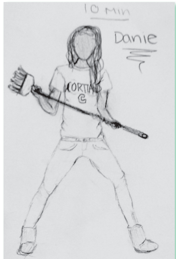
10 minute figure drawing of Danie Doller by Maddie Doll