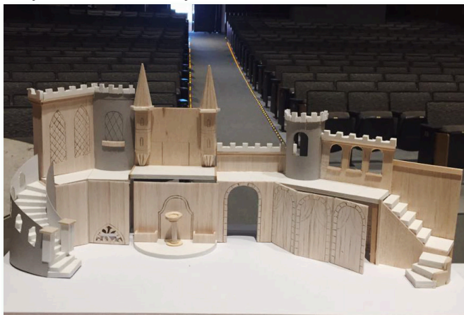
Scale model of the elaborate set design by Mr. Steve Boel.

Rehearsals and set construction are in full swing as the GCS Footlights cast prepares to transport the audience back to a fictional medieval kingdom in 15th Century Europe. Once Upon a Mattress is a family friendly show that is packed with side-splitting shenanigans. After this hilarious take on Kings, Queens, Princesses and Jesters, you'll never look at fairy tales the same way.