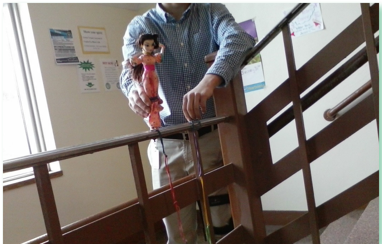
Barbie ready to test her Bungee